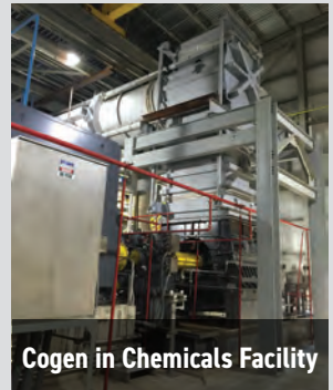
Cogen in Chemicals Facility