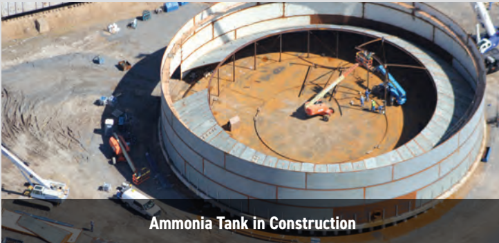
Ammonia Tank in Construction

Merrick's clients also have access to The Merrick Consultancy, where subject matter experts can be employed on studies ranging from identifying business, technical and/or operational issues and challenges, facility audits to identify profit improvement opportunities to reliability assessments, and value chain optimization.