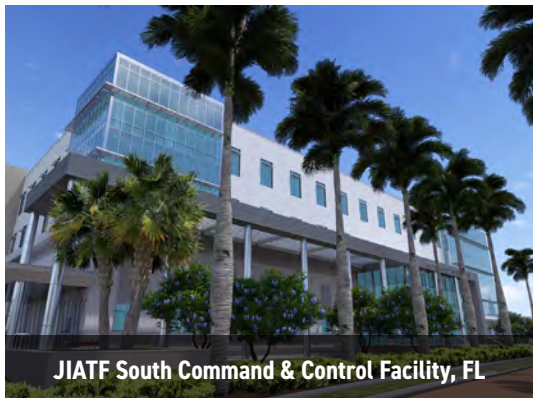
JIATF South Command & Control Facility, FL