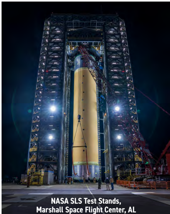
NASA SLS Test Stands, Marshall Space Flight Center, AL