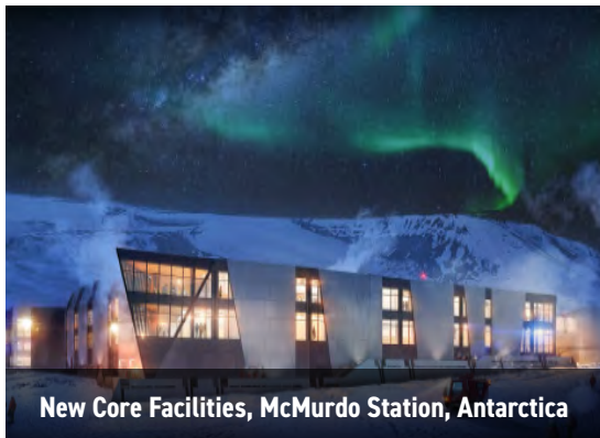
New Core Facilities, McMurdo Station, Antarctica