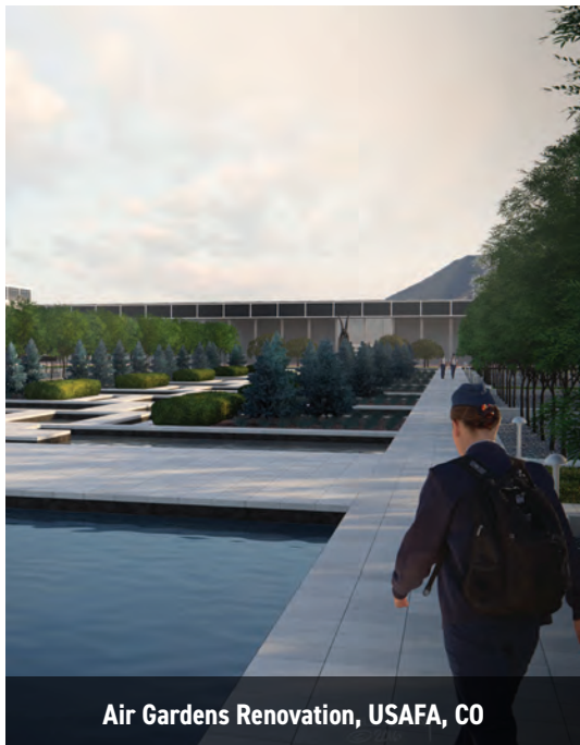
Air Gardens Renovation, USAFA, CO