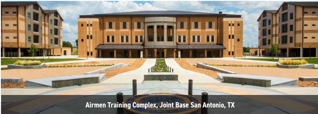
Airmen Training Complex, Joint Base San Antonio, TX