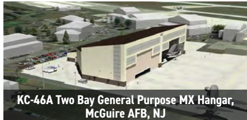
KC-46A Two Bay General Purpose MX Hangar, McGuire AFB, NJ