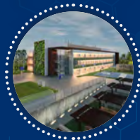
Global Health Security Consulting