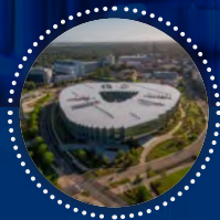
Pharmaceutical and Biopharmaceutical Facilities