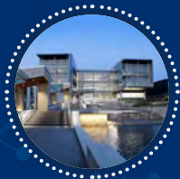
Biosafety and Biosecurity