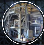
Facility & Equipment Integration