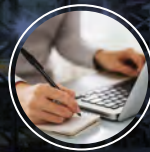
Capital Line-Item Design Project Leadership & Execution