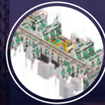
Special Nuclear Material Process Equipment