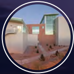
Nuclear & Non-Nuclear Facility Design

Revitalizing our nuclear infrastructure and restoring production capabilities is of vital importance for our nation's security and defense. We're committed to supporting you as you restore and maintain our national nuclear deterrent. In the last three decades, we've supported nuclear missions at facilities across the US—from the Savannah River Site and the Los Alamos National Laboratory to Y12 and Pantex. This experience gives us the ability to anticipate the what-ifs associated with your specialized nuclear facility and equipment design needs, without compromising sensitive information. We also have a deep understanding of how to integrate specialized equipment designs within your facility infrastructure. As your total nuclear design partner, we're dedicated to advancing your critical defense mission. Our experience includes: