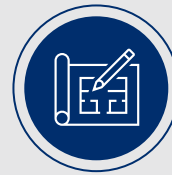
Design & Commissioning