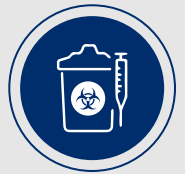
RMW Waste Management