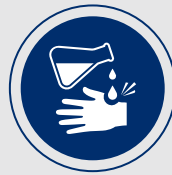
Spill/Exposure Response Training