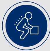
Think Lift Ergonomics