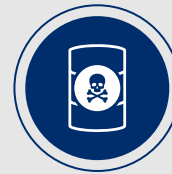
Hazardous Waste Management