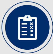
Lab, ICRA, EOC Surveillance