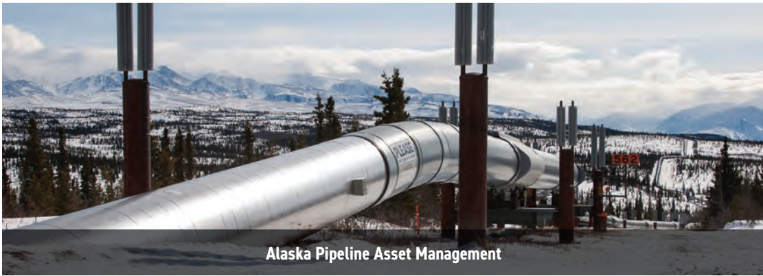
Alaska Pipeline Asset Management