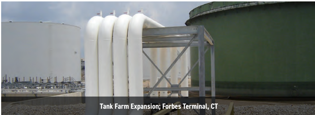
Tank Farm Expansion; Forbes Terminal, CT