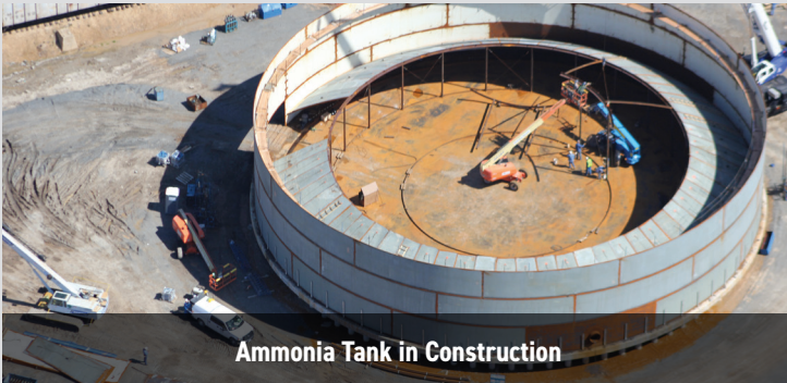
Ammonia Tank in Construction

Merrick's clients also have access to The Merrick Consultancy, where subject matter experts can be employed on studies ranging from identifying business, technical and/or operational issues and challenges, facility audits to identify profit improvement opportunities to reliability assessments, and value chain optimization.