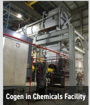
Cogen in Chemicals Facility