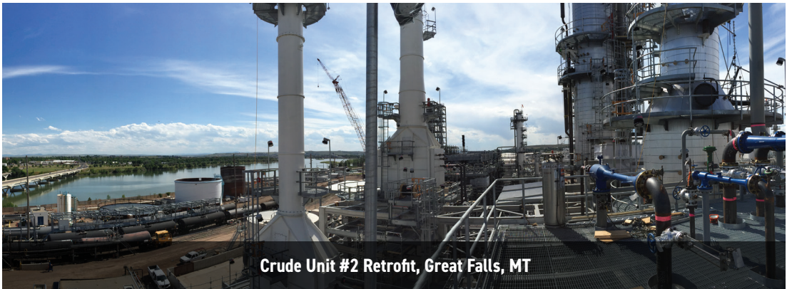
Crude Unit #2 Retrofit, Great Falls, MT