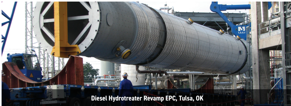
Diesel Hydrotreater Revamp EPC, Tulsa, OK