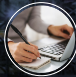
Capital Line-Item Design Project Leadership & Execution