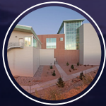
Nuclear & Non-Nuclear Facility Design

Revitalizing our nuclear infrastructure and restoring production capabilities is of vital importance for our nation's security and defense. We're committed to supporting you as you restore and maintain our national nuclear deterrent. In the last three decades, we've supported nuclear missions at facilities across the US—from the Savannah River Site and the Los Alamos National Laboratory to Y12 and Pantex. This experience gives us the ability to anticipate the what-ifs associated with your specialized nuclear facility and equipment design needs, without compromising sensitive information. We also have a deep understanding of how to integrate specialized equipment designs within your facility infrastructure. As your total nuclear design partner, we're dedicated to advancing your critical defense mission. Our experience includes: