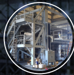
Facility & Equipment Integration